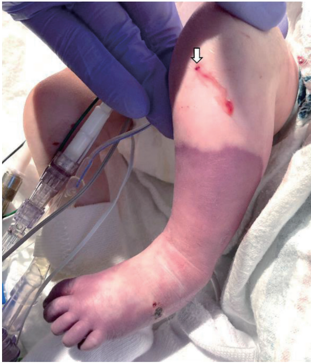
Figure 1. Following the resuscitation, there was progressive decreased perfusion and cyanosis of the left lower extremity with significant color change from the mid-tibia distally to the foot. The intraosseous needle insertion site is noted (white arrow).