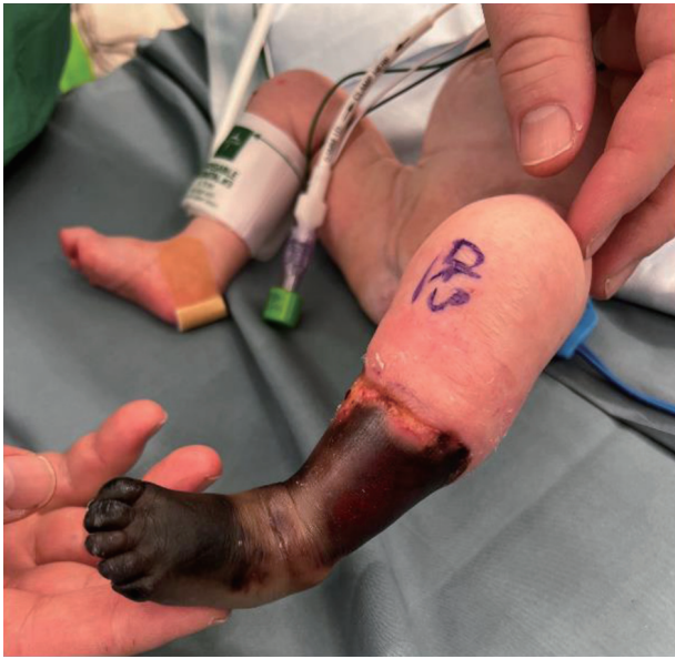
Figure 2. Photograph showing progressive demarcation of the injured extremity.

the needle into the intramedullary cavity of the sternum of adults, the practice has changed primarily to involve the use of the intramedullary cavity of long bones, primarily the proxi-