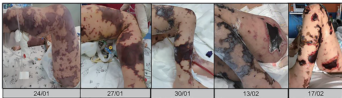
Figure 3. Skin lesions evolution in the pediatric intensive care unit.