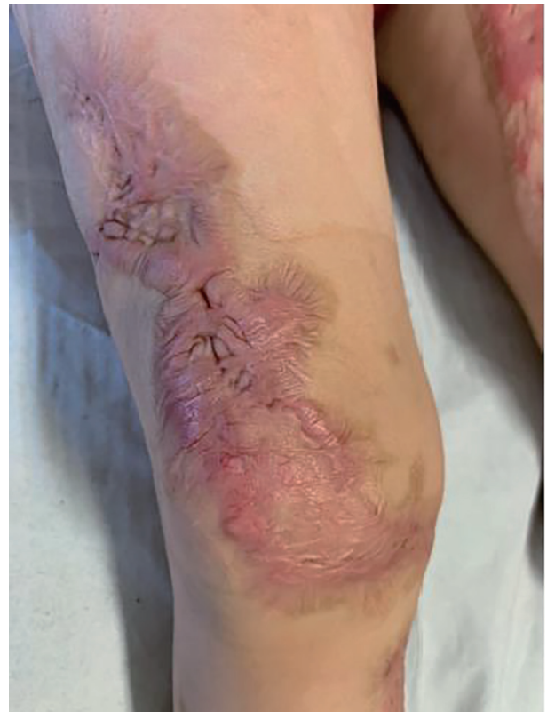
Figure 5. Hypertrophic skin scars after escharectomies and skin grafts.