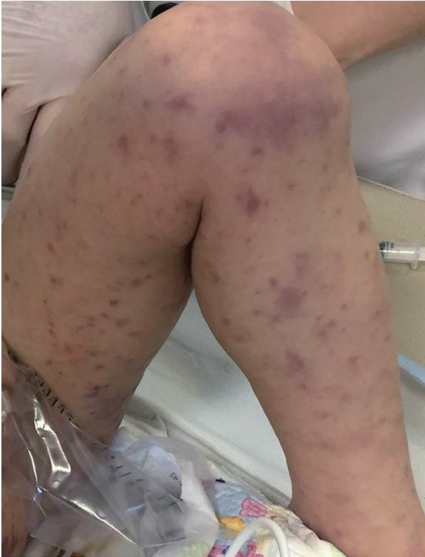
Figure 1. Extremely rapid numerical increase in skin lesions in the emergency room.