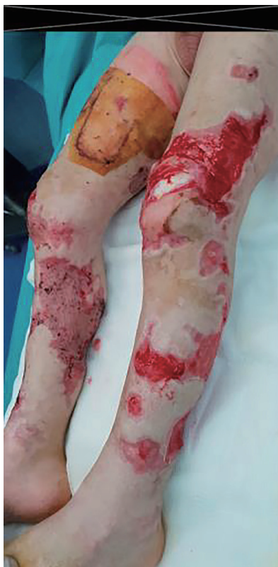
Figure 4. Skin ulcer in lower limb.