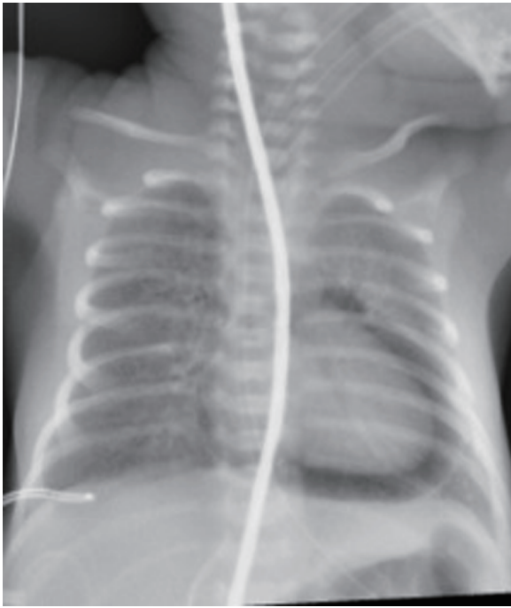
Figure 1. The first chest X-ray revealing PPC without any other air leak.

pCO 2 : 51.4 mm Hg, HCO 3 : 22.6 mmol/L, base excess: -4.4 mmol/L and lactate: 2.4 mmol/L.