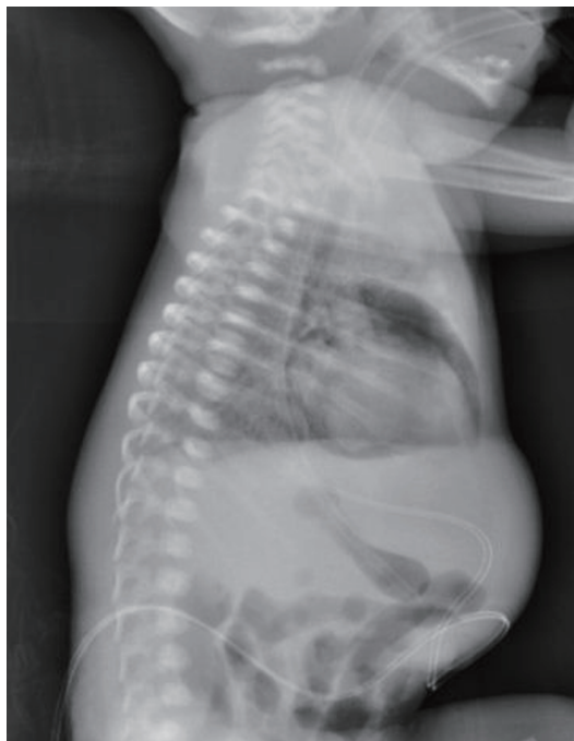
Figure 2. Lateral view of PPC.

The vital parameters upon admission to NICU showed a heart rate of 156 beats/min, respiratory rate of 68/min with intercostal retractions, nasal flaring and grunting. Capillary refill