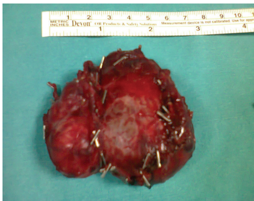
Figure 3. Histopathological evaluation.

at 180/100 mmHg with no orthostatic changes. In laboratory evaluation, pathological values were as follows: fasting blood glucose, 142 mg/dL; red blood cell (RBC), 5.2 million/mm 3 ; white blood cell (WBC): 13.2 × 10 3 /mm 3 ; absolute neutrophil count (ANC), 3,400; erythrocyte sedimentation rate (ESR), 65 mm/30 min (Table 1).