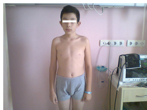
Figure 1. Features of patient.