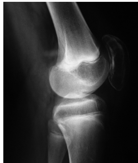
Figure 1. Radiography of the right knee showing an osteolytic lesion involving the hole patella.

An open bone biopsy of the patella with intraoperative frozen section was performed. The soft tissues appeared normal, but a thin anterior cortex of the patella was seen and punctured with an elevator. After removal of a large window of thin cortical bone, a large well-defined cavity filled with serosanguinous fluid was found. A rim of tissue that lined the cavity and curettings from within the cavity were sent for histologic analysis. The bony rim was sclerotic and intact.