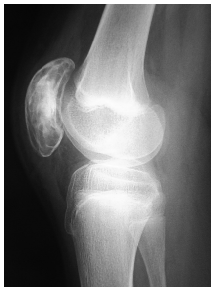
Figure 3. Radiography of the right knee showing the iliac graft packing of the patella.

Radiologically aneurysmal bone cysts appear as an eccentric or central osteolytic lesion with cortical expansion, giving a ‘blown-out’ appearance with extension into soft tis-